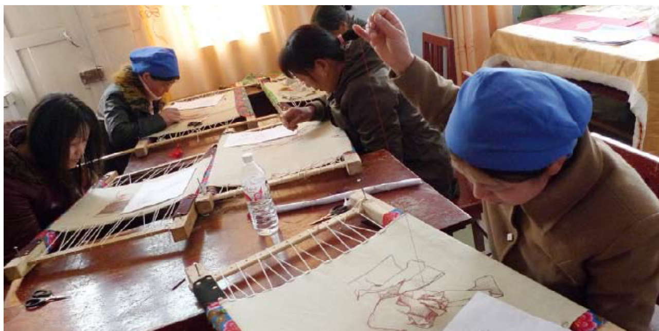
Textile Dreams / Wen Fang – From May 27 to June 19, 2010 / Yishu8, Beijing