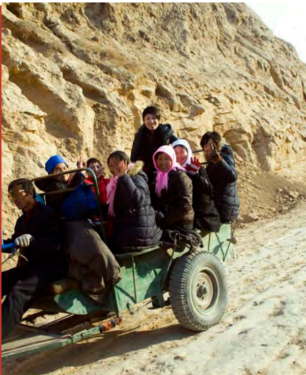
Fang (standing) with the Flowers, and a sunny drought landscape.